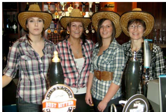
Yes, they do accept cheques behind the bar