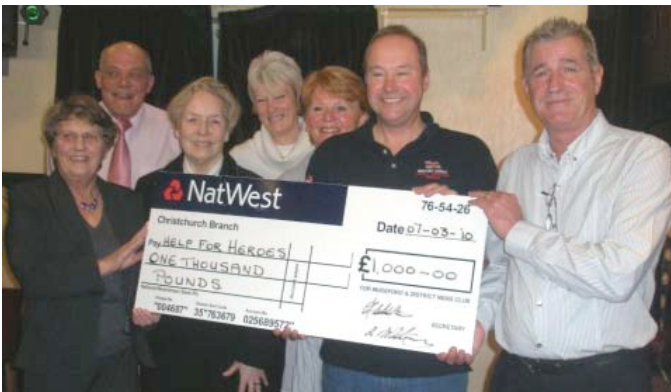
The recipients of your charity fundraising

On Sunday 7 th March 2010 we once again presented cheques to the various deserving causes, as chosen by the members. A total of £4,000 was distributed on the day and this sum is in addition to other donations worth around £1,000 during the year.