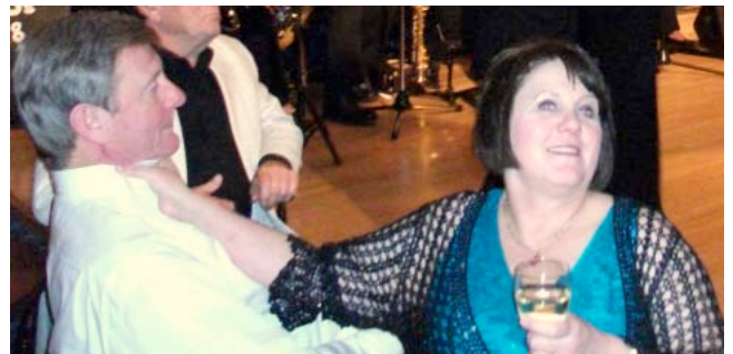
"What do you mean you want to stand for Treasurer!!!"

Finally, as you probably realise, the costs of the tickets is still heavily subsidised and this subsidy has to reduce. What would you be prepared to pay for your tickets?